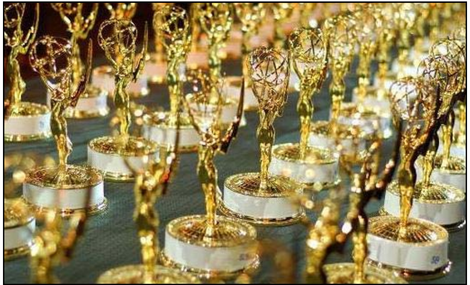
Heather Curbow—Team Photogenic